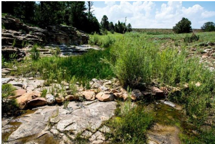
One rock dams